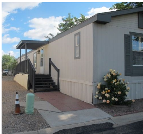
COMING IN AUGUST - GREAT LOCATION - NEW APPLIANCES

PURCHASE PRICE ..... $89,900 SIZE ..... 18 X 76 TYPE OF HOME ..... Singlewide SQ. FEET ..... 1368 MONTHLY COMM. FEE .... $606